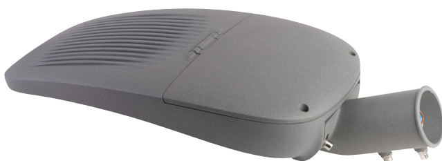
LED driver is separated from LED module