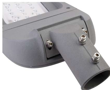
Adjustable tilt angle