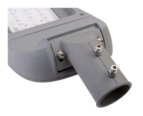
Adjustable tilt angle