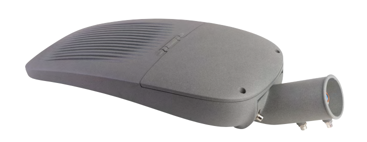
LED driver is separated from LED module