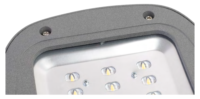
Uniform light distribution by using asymmetric optics

The luminaire has an integrated surge protection and it is suitable for poles with a diameter of max 60mm.