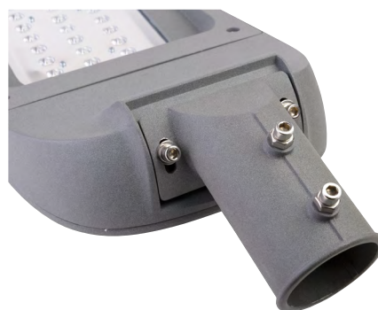
Adjustable tilt angle