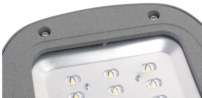
Uniform light distribution by using asymmetric optics

The luminaire has an integrated surge protection and it is suitable for poles with a diameter of max 60mm.