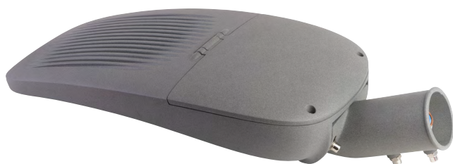
LED driver is separated from LED module