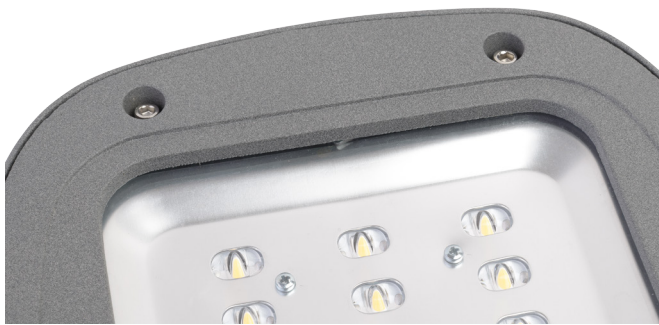
Uniform light distribution by using asymmetric optics

The luminaire has an integrated surge protection and it is suitable for poles with a diameter of max. 48mm. An adapter for poles with diameter 60mm is available under order number 51754.